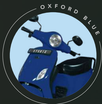
for the formal