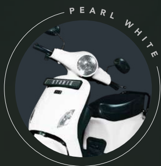
for the tranquil