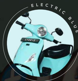
for the bold