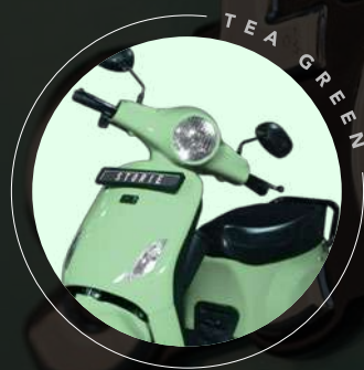
for the serene