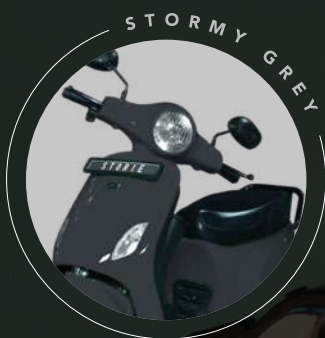
for the wild