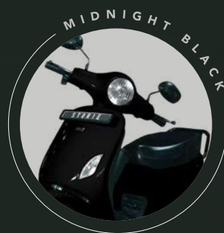
for the knights