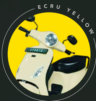
for the vibrant